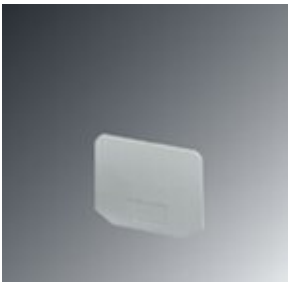
End cover, width: 2.3 mm, color: gray

Please be informed that the data shown in this PDF Document is generated from our Online Catalog. Please find the complete data in the user's documentation. Our General Terms of Use for Downloads are valid ( http://phoenixcontact.com/download )